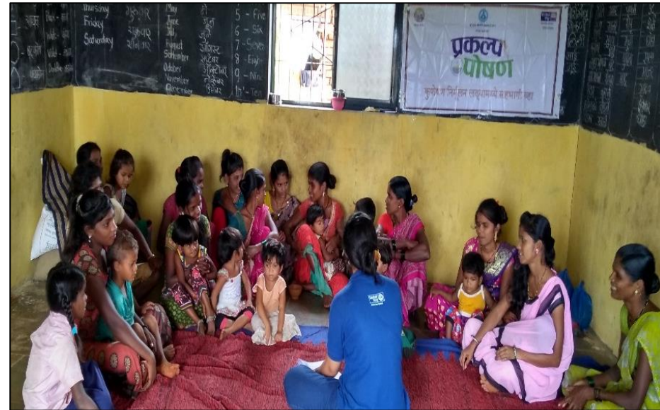
Communiy discussions in Tarwadi – Karjat