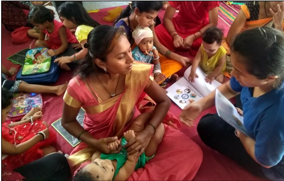
One on one discussion with lactating mother in Nevali – Panvel

UWM team conducted one to one health enquiry, educational sessions with women in the communities to communicate benefits of breastfeeding and how it helps in overall well-being and lays foundation for health future of infants