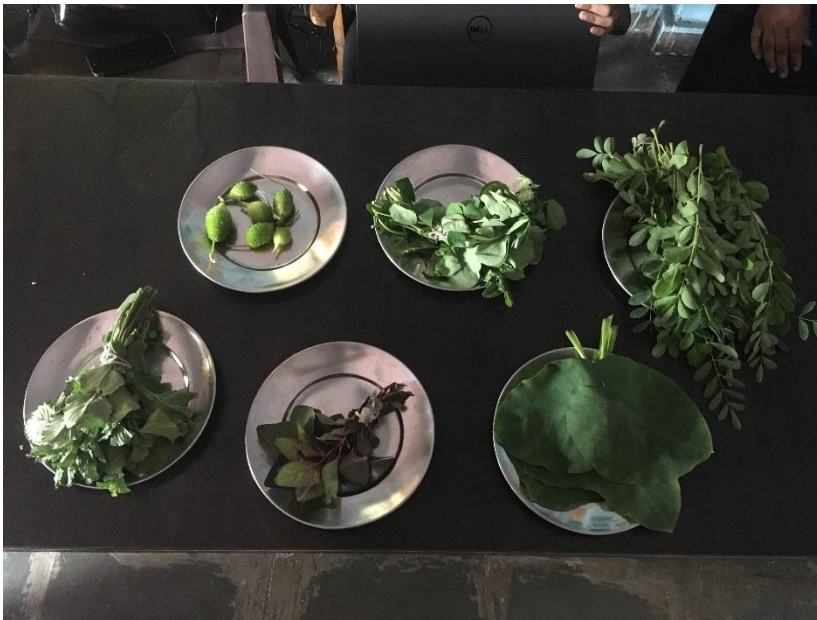
Display of green leafy vegetables at Chinchawli – Panvel

Through this, UWM engages women in conversation around safe birth and vitality of breast feeding. This has proven to be an effective platform to educate women in the communities.