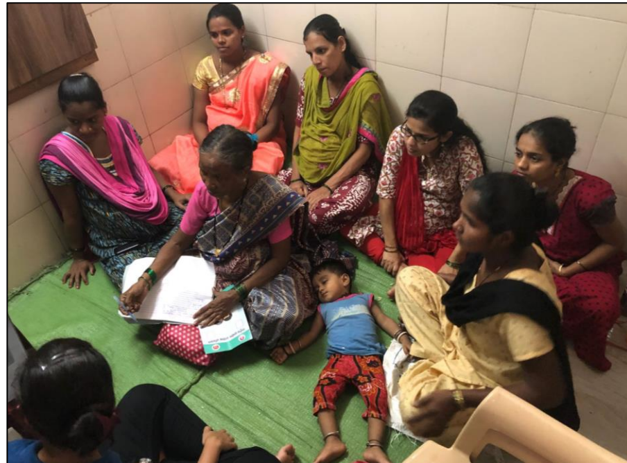
Participation of ASHA worker in community discussion in AWC no. 176, Wadala