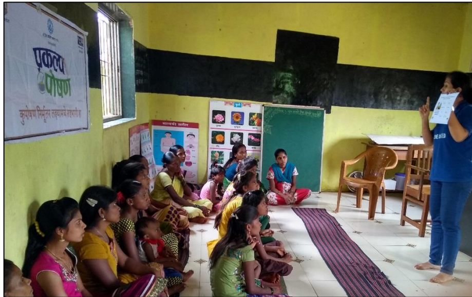
Communiy discussions in Morewadi – Karjat