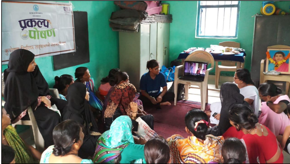
Video display to show breast crawl breastfeeding at anganwadi in Salokh – Karjat

Despite numerous benefits of breastfeeding and decades of doctors' recommendations, only 41.6 % infants start breastfeeding within one hour of life and 55 per cent of infants under six months are exclusively breastfeed.