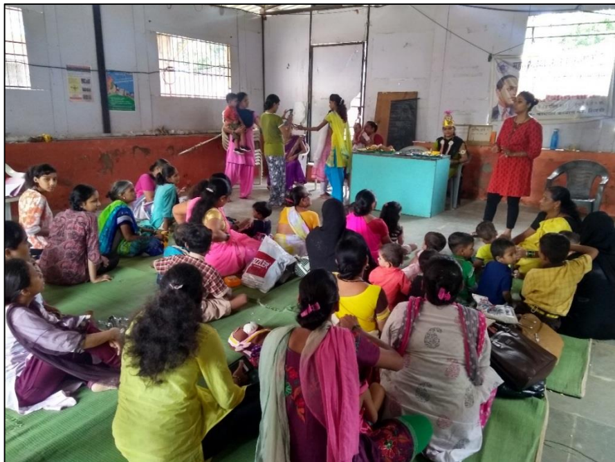
ASHA worker explaining the importance of breast feeding with the beneficiaries of AWC no. 136,145,159