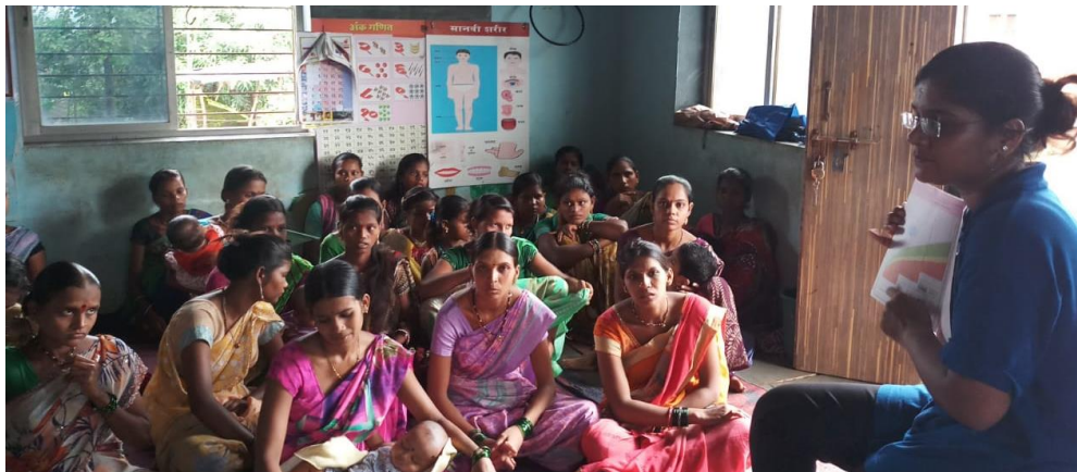
Explanation of effect of improper breast feeding on children's growth with the help of growth chart in Male – Karjat

Despite numerous benefits of breastfeeding and decades of doctors' recommendations, only 41.6 % infants start breastfeeding within one hour of life and 55 per cent of infants under six months are exclusively breastfeed.