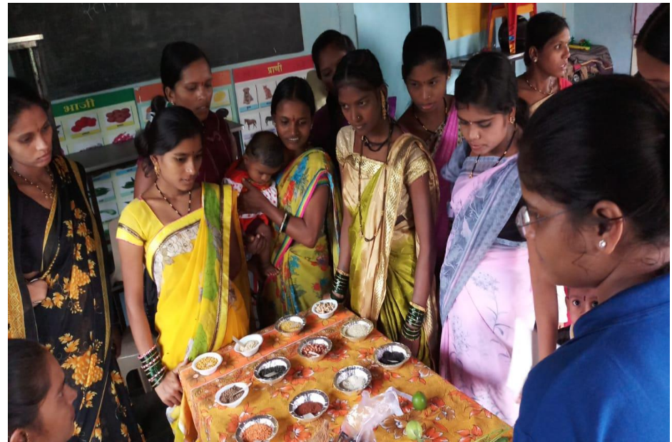
Display of dals , pulses and green leafy vegetables at Male